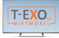
LCD TV 55" Price: 405€ Color: standard