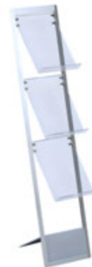
Piazz Price: 66€ H 120 | W 36 | D 28 Color: standard