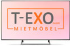
LCD TV 40" Price: 285€ Color: standard