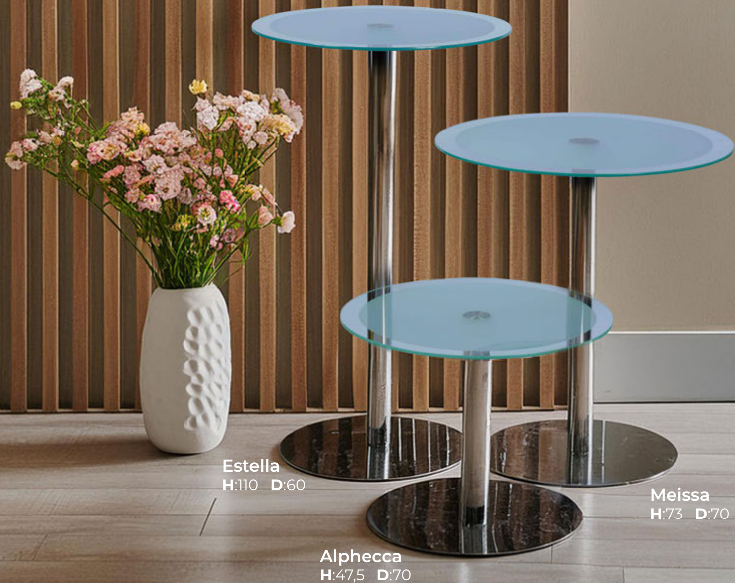
Estella H:110 D:60