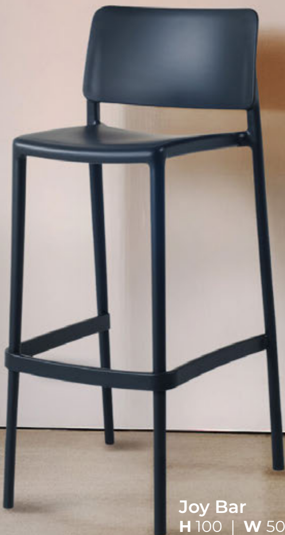
Joy Bar H 100 | W 50 | D 48