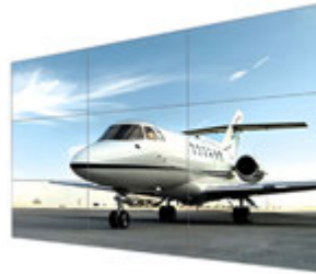
Videowall & Ledwall Price : Upon request Maße: 2x2 / 3x3 / 4x4 / 4x3 / 3x2 Color: standard