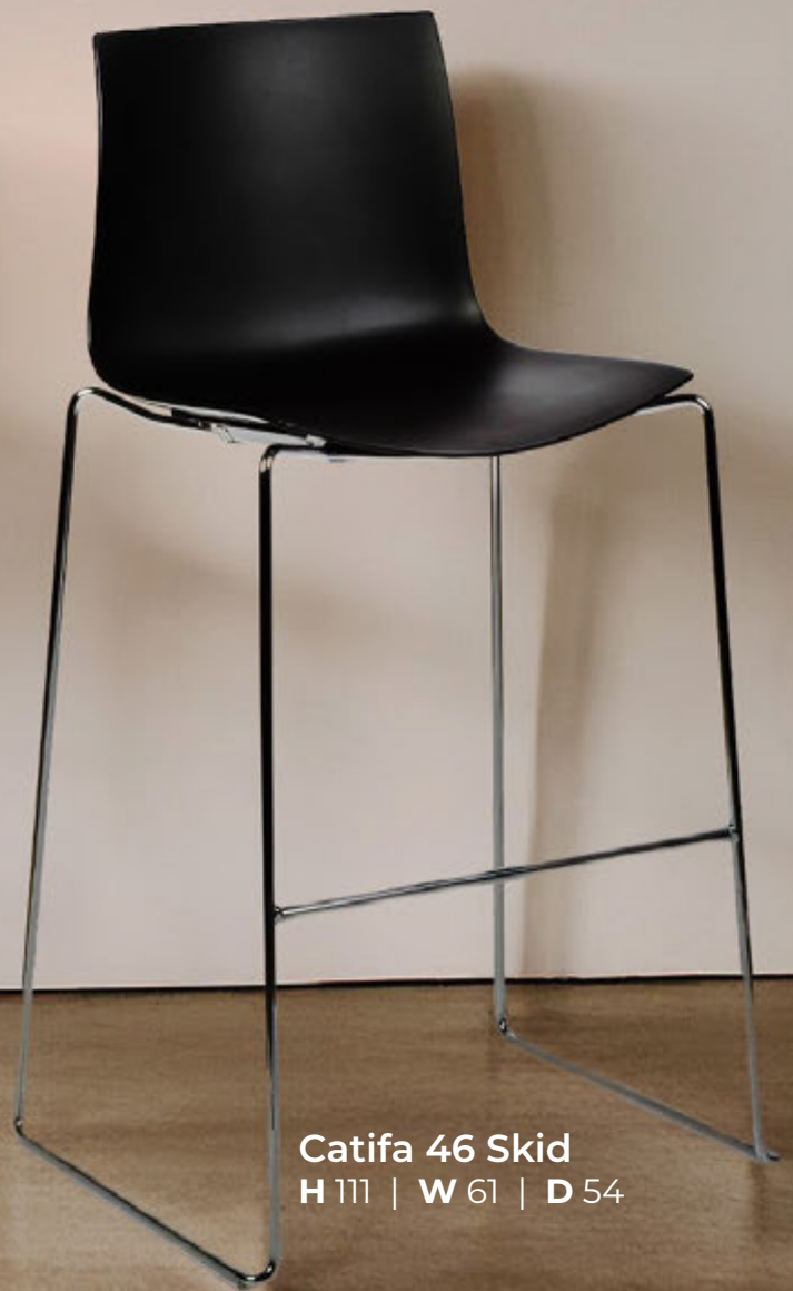
Catifa 46 Skid H 111 | W 61 | D 54