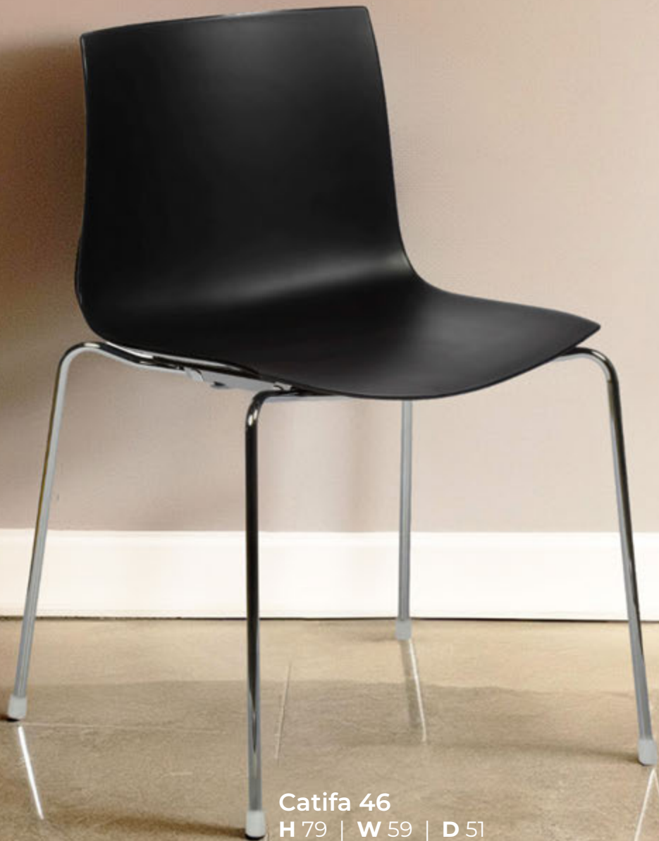
Catifa 46 H 79 | W 59 | D 51