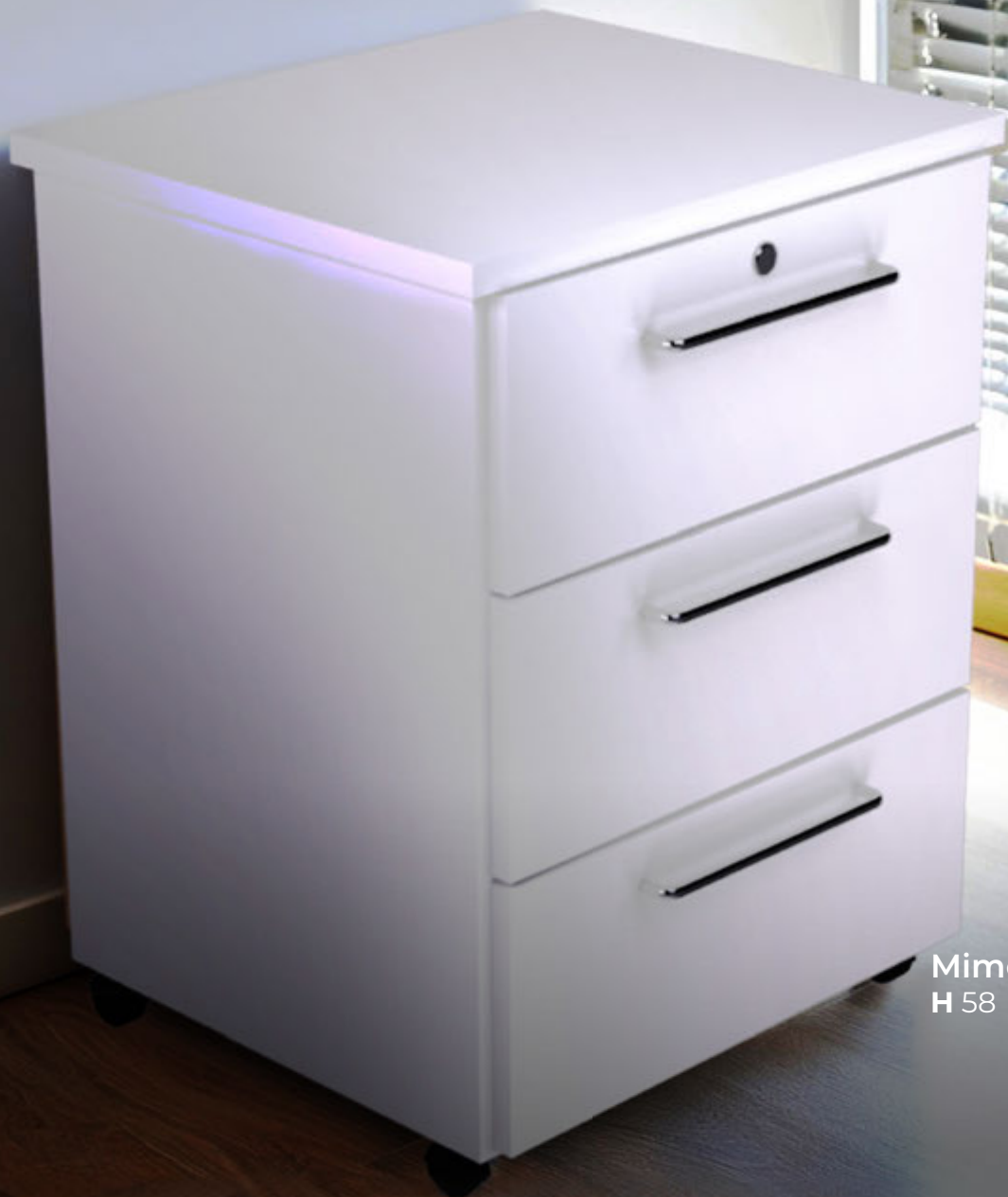
Mimosa H 58 | W 47 | D 41