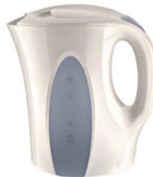
Water Heater Kettle