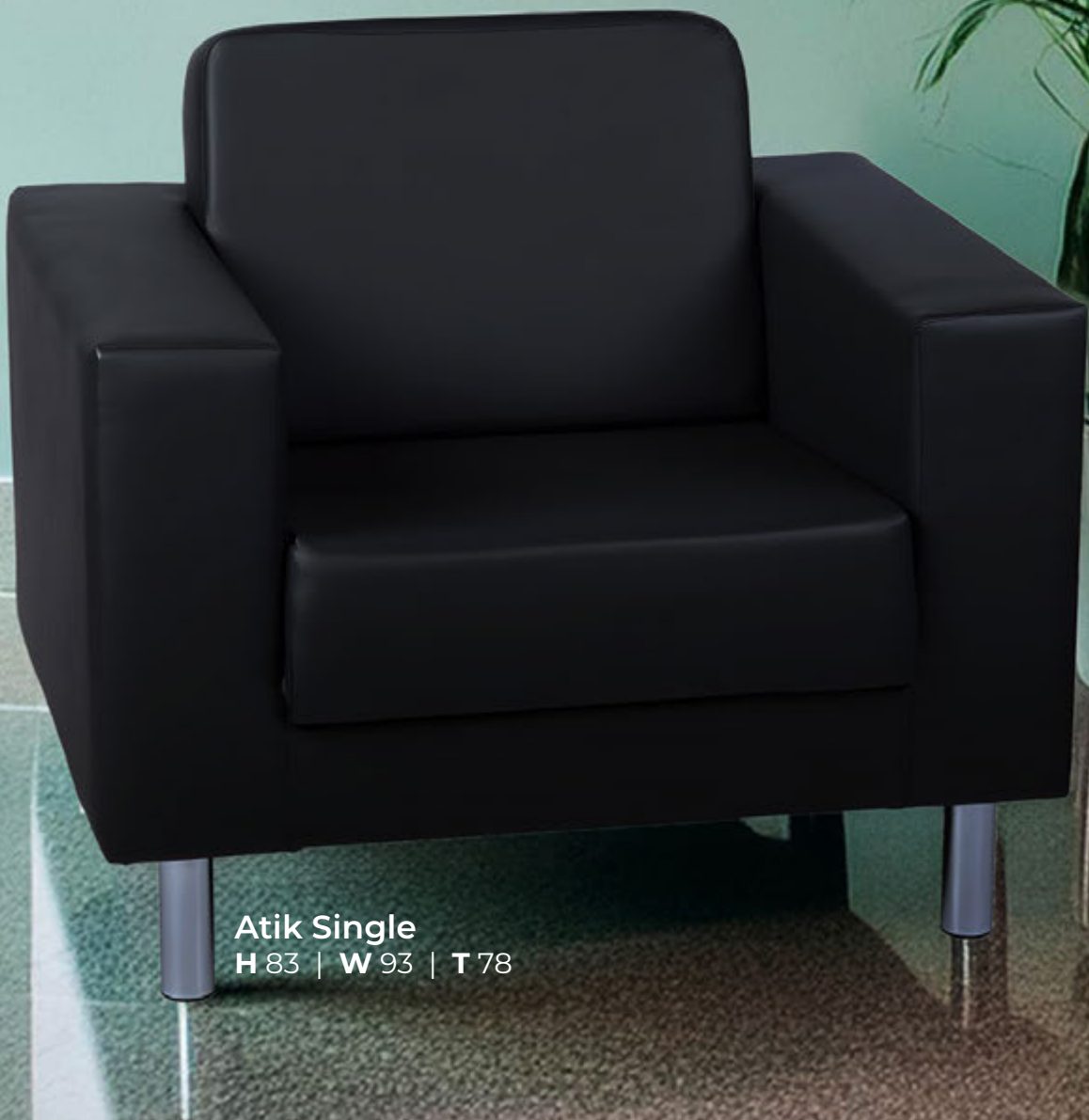
Atik Single H 83 | W 93 | T 78