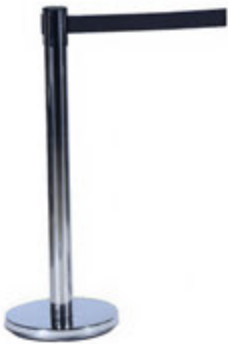
Barrier post Price: 60€ H 91 W 32 D 190 Color: silber